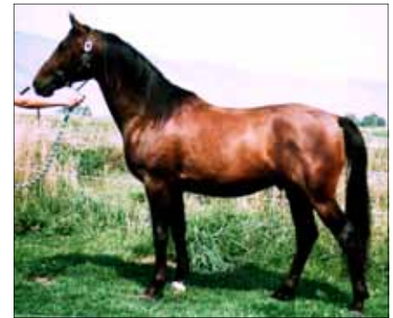
*Amurath Samurai's grandchildren continued! Above left to right: The purebred Shagya Arabian gelding Wineglass Perpetual Motion [Max (by *Amurath Samurai) x Bepa AF by *Shandor]. The Part-Shagya Arabian filly Elerrina Starlight [Starwalker (by *Amurath Samurai) x RA Desert Storm ox]. The colt Shagya Skamp AF (Janos x Samantha by *Amurath Samurai). Below left to right: The Part-Shagya gelding H. Wineglass Gabriel (Max x H. Wineglass Glory from Bepa AF). The purebred Shagya-Arabian fillies Wineglass Dora (Max x WineGlass Diva by *Budapest) and Everlasting Star AF (Starwalker x Empress Ester AF by *Shandor). See more horses in "Glimpses " page 11 & 12.