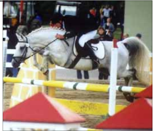
NEDDOR. Kreuth, Germany.