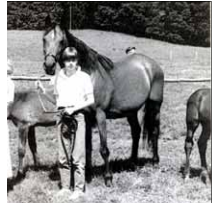
Amurath Sadika (Gharib x Panama VII).