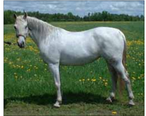
*Korina (Navarra x *Kornelia by Koheilan I)