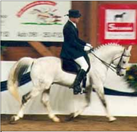
NEDDOR, Alsfeld, Germany.