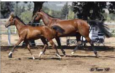
The part-Shagya gelding Reveille SF trots with his Thoroughbred dam at her warmblood inspection. Shagya-Arabian mares and stallions are also often welcome for inspection with warmblood registries. Go present them!