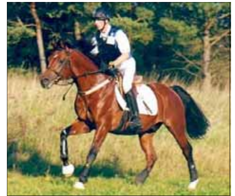
Left to right: The European Shagya-Arabian stallions Amurath Koheilan (Koheilan II x Amurath Sadika), Kartango-Kahn and Kublai Khan, both by Kamour (Amor x Kolina) from the mare Amurath Saskia, full sister of *Amurath Samurai.