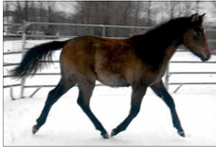
Above: Neddora SHG (Neddor x *Lutka)