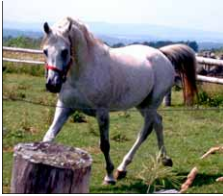
*Amurath Samurai (Navarra x Amurath Sadika).