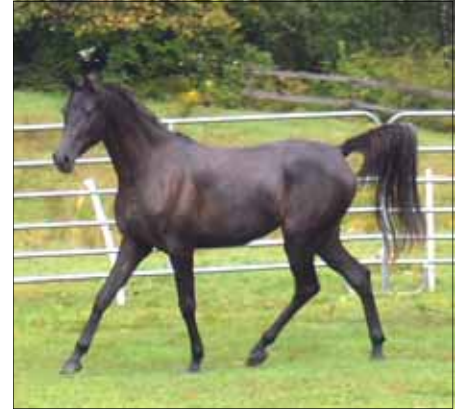
Left to right: The Part-Shagya mare Samurai's Sweet Luna (*Amurath Samurai x TB mare), and the purebred Shagya-Arabian mares Natasha (*Amurath Samurai x *Korina by Navarra) and Serena (*Amurath Samurai x Shamballah by *Oman).