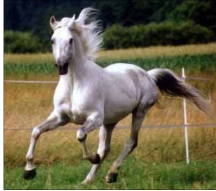
Neddor (Navarra x Nora I by Nasrallah).