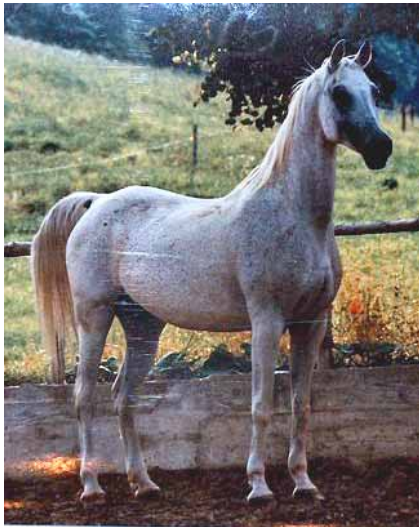
Above: Nedda (Jussuf VII x 288 O'Bajan X).