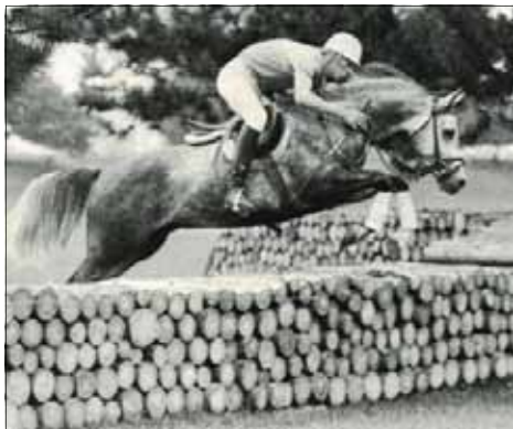
Above: Navarra (Saphiro x Nedda) at his HLP.