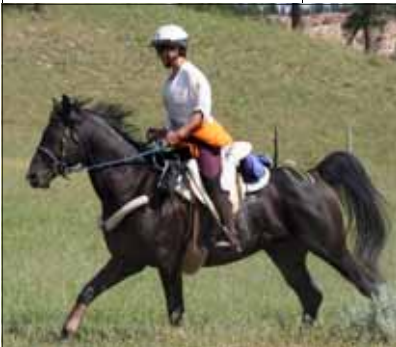
Above: The purebred Shagya-Arabian endurance stallion JANOS (*Salem x *Bashira) has been sold to Japan. Bon Voyage, Janos!