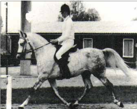
Above: Saphiro (Czardas x Szikra I) at his HLP in 1979.