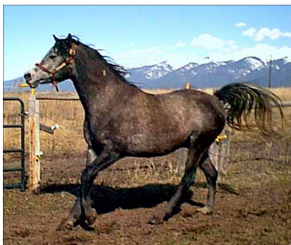
Rio Bravo AF (Janos x Rachelle AA x Hungarian Bravo)