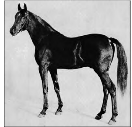
Above: Gharib Or.Ar. (Anter x Souhair)

Navarra, Samurai's sire, is also the sire of Stellis'