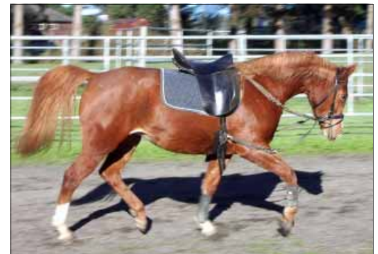
The second generation... *Amurath Samurai's Grandchildren: Above: The mare Sophie AF (*Shandor x Samantha by *Amurath Samurai). Below: The stallion Evanescent Star AF [Starwalker (by *Amurath Samurai) x Echo Daal].