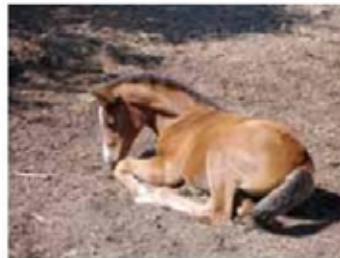
KB Sigal Fahim KB Omega Fahim++/ X Sophie AF