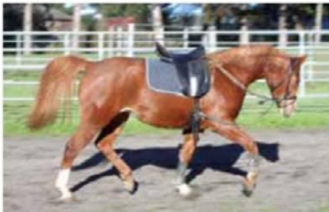
Sophie AF - in foal to KB Omega Fahim++/

2008 foals for sale two purebred Shagyas one part Shagya/Arabian