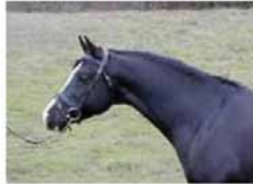
KB Omega Fahim++/