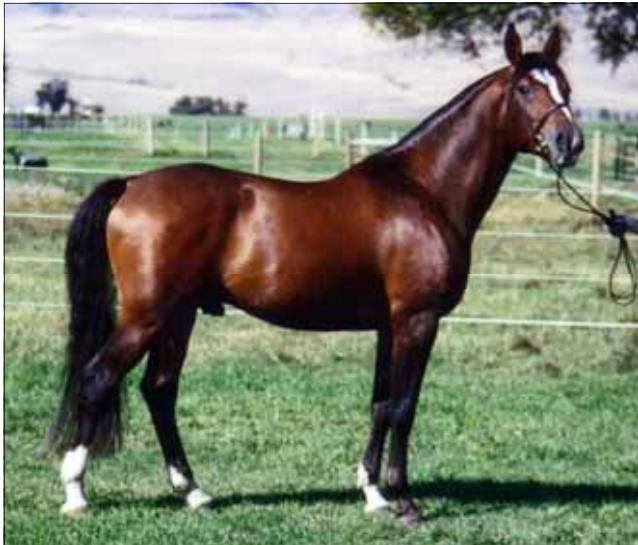
SHAGYA ROYAL AF 16 hands, Bay

Live cooled transported semen only, excellent quality.