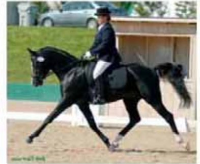
KB Omega Fahim++/

Standing the NASS approved Arabian stallion - KB Omega Fahim++/