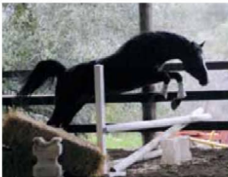
KB Omega Fahim++/

Elaine Kerrigan 1479 Freshwater Rd. Eureka, Ca. 95503 707-443-0215 fahim@humboldt1.com www.kerriganbloodstock.com