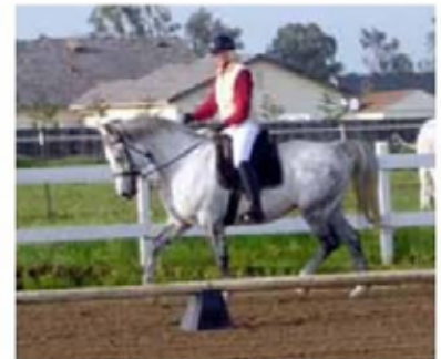
new acquisition Shagya's Serena AF