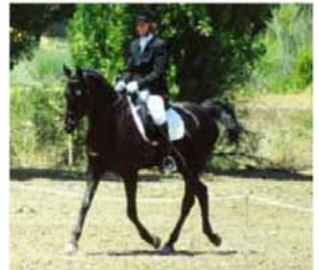
KB Salim Fahim - in foal to Shagya Royal AF

2008 foals for sale two purebred Shagyas one part Shagya/Arabian