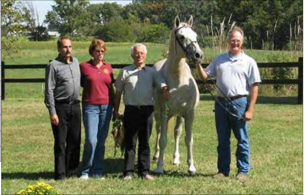
Above: Meritorious Sires: Champion: *Budapest AF (Shagal x *Biala). Below: Reserve Champion: *Shandor (Shagal x 41 Shagya XXXIX).