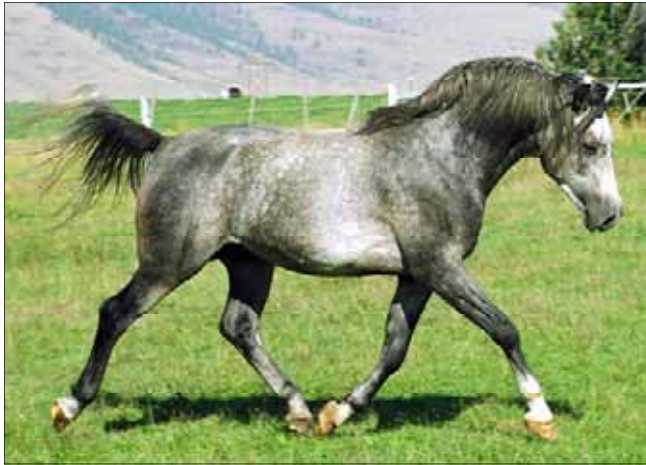
STARWALKER 16.1 hands, Grey

Starwalker throws large, often colored foals with great movement, conformation, and personality! Congratulations to his two sons recently approved for Shagya breeding by NASS!!