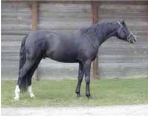
KB Omega Fahim++/